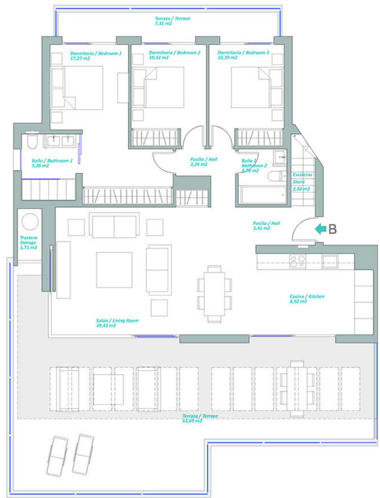
Pianta inferior / Lower floor